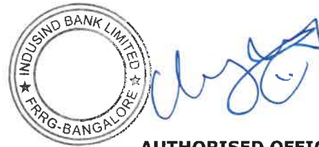
AUTHORISED OFFICER INDUSIND BANK LTD

The borrower/guarantors/mortgagors are hereby notified to discharge the liability in full and pay the dues as mentioned above along with up to date interest and expenses within 15 days from the date of this notice failing which the -secured Asset- (mentioned above) will be sold as per the terms and conditions mentioned above. In case there is discrepancy between the publications of sale notice in English and vernacular newspaper then in such case the English newspaper will supersede the vernacular newspaper and it shall be considered as the final copy, thus removing the ambiguity.